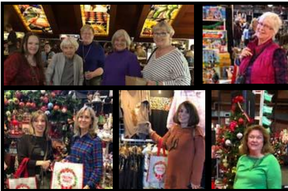
Fun times at our November field trip to the Chi Omega Christmas Market!